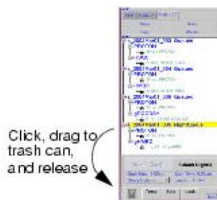
Figure 1. Removing a Sample from the Study Queue